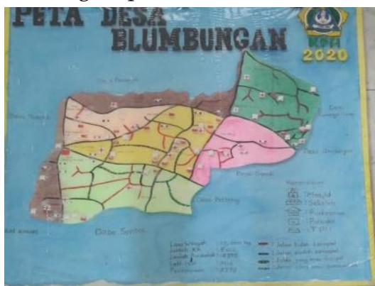
Map Picture 2

planning, maps can be used as material for regional analysis by taking into account the existing land cover in the planning area. In addition, the level of settlement density can also be used as material for analysis of development planning in the form of public facilities that can be utilized by the community. The area of Blumbungan Village is dominated by settlements. There are only a few green open spaces available. Diversion of land for green open space can also be planned by utilizing maps.